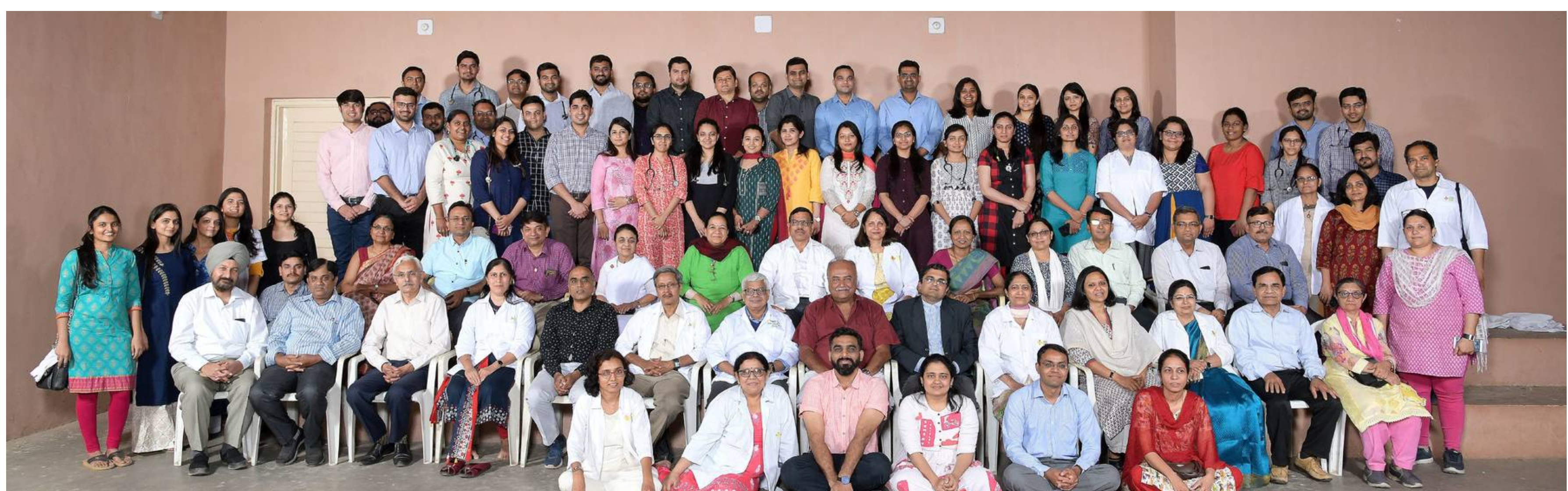
PG Farewell Batch 2019